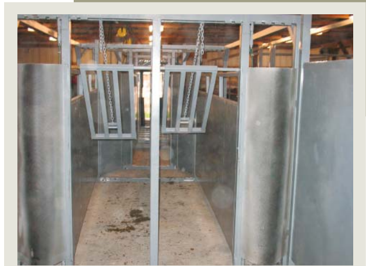
Backstops are easily adjustable to cattle size and help keep cattle moving forward. Flexible and durable rubberized fabric allows for width adjustment of alleys. Note the notches on top and bottom rails with spring-loaded deadbolts connected by a pull cable for easy width adjustment (designed by RB Mfg., Steele, N.D.)

This CREC design has unique adaptations for the space available and for the research mission. The same principles of cattle movement and flow apply to commercial facilities, but the size and arrangement of the holding