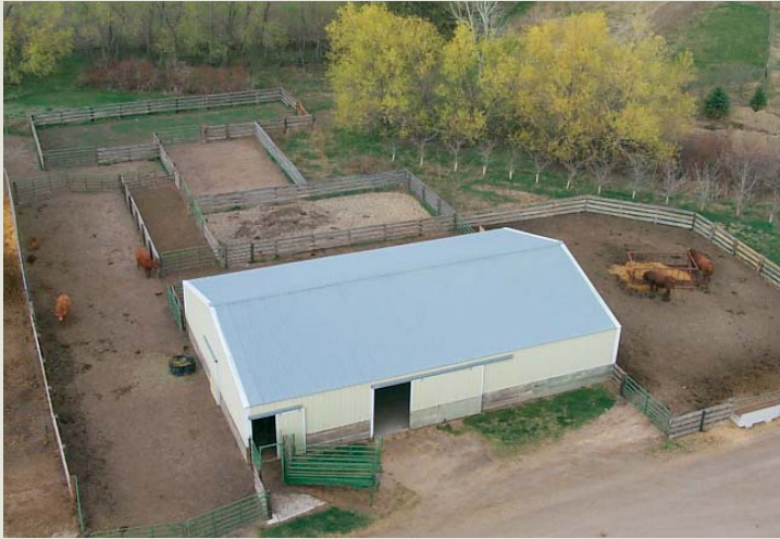
Overhead view of the north barn with outside holding pens, alleys and loading chute on the south side. Barn dimensions are 64 feet by 40 feet.