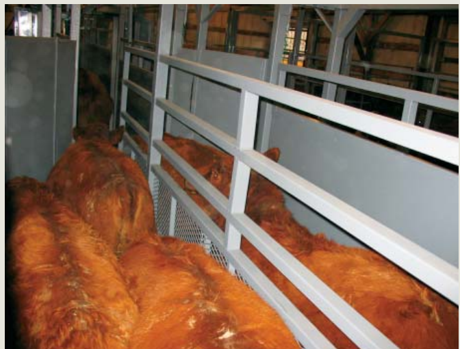
Cattle move into the double alley from the staging pen and past a spring-loaded swinging gate into the single-animal alley before entering the scale and chute. Expanded metal in the center panel allows animals in adjacent alleys to see each other, which lowers stress levels. The width of the double and single alleys is easily adjustable.