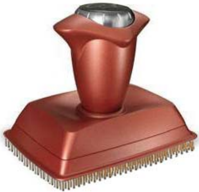
Applicator & Disposable Needles