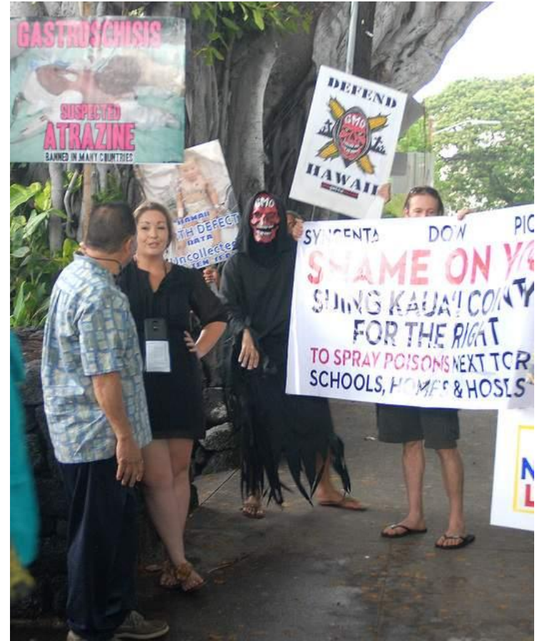
Activists protest at a recent NASDA event