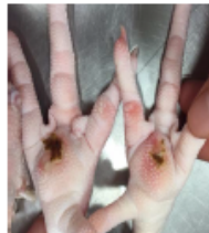
Pass (washed, post-scald paws with scab covering less than 1/2 the area of the foot pad)