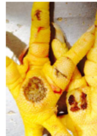
Fail (washed paws) Ulceration is present and lesion is more than 1/2 the area of the foot pad; lesions are also present on the toes