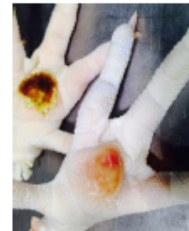
Fail (paws without cuticle) Ulceration is present and the lesion is more than 1/2 the area of the foot pad. Swelling of the foot pad is also visible.