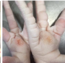
Pass (paws with no cuticle and normal skin color)